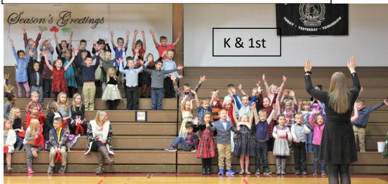
K & 1 st