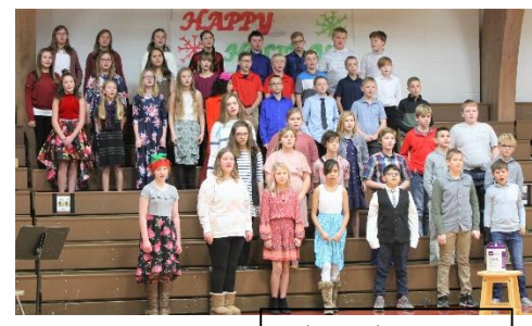
5 th & 6 th Grade