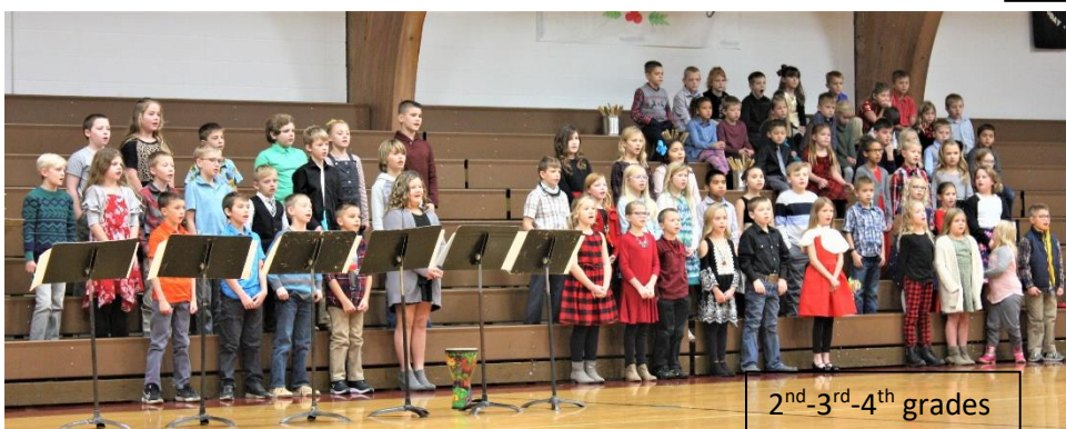
2 nd -3 rd -4 th grades