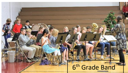
6 th Grade Band