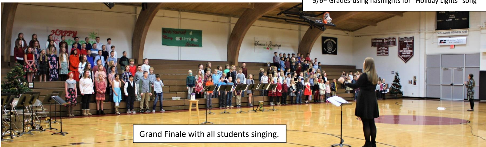
Grand Finale with all students singing.