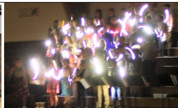
5/6 th Grades-using flashlights for "Holiday Lights" song