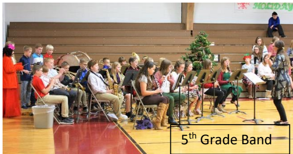
5 th Grade Band