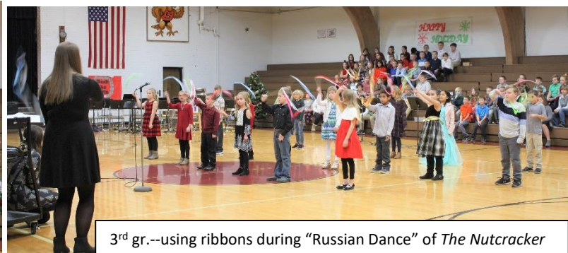
3 rd gr.--using ribbons during "Russian Dance" of The Nutcracker