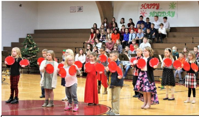
2 nd gr.--using plates during "The March" of The Nutcracker