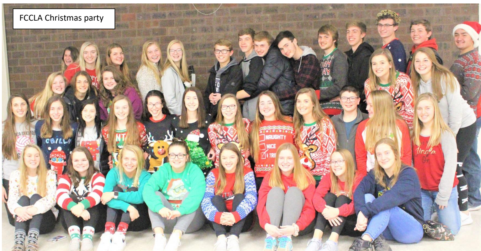
FCCLA Christmas party

We ended our semester with a joint meeting with our National Honor Society chapter. We all enjoyed caroling at our local nursing home and assisted living center and a few Christmas snacks. Our members are busy working on our projects to present at region and at the state FCCLA convention.