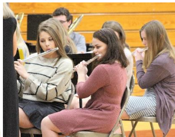
Seniors in Band & Choir